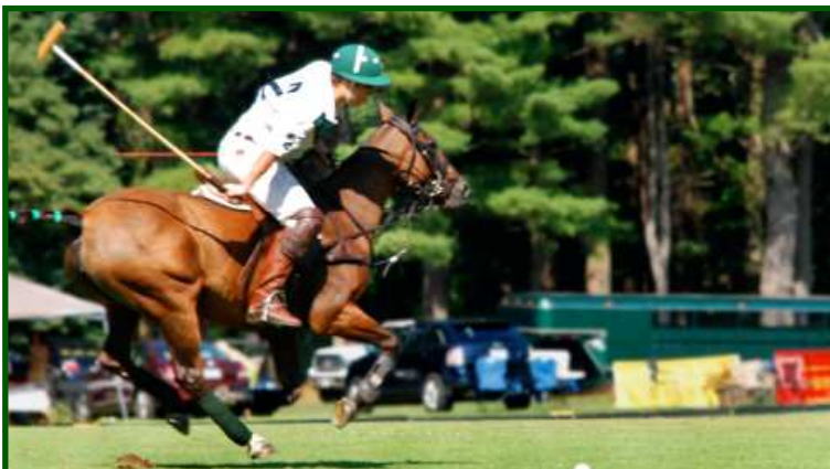
The match is underway. This pony is flying, with all four feet off the ground