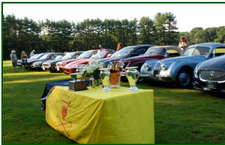
Our Jags lined up on the field prior to presenting the JANE Jaguar Cup to the winning team