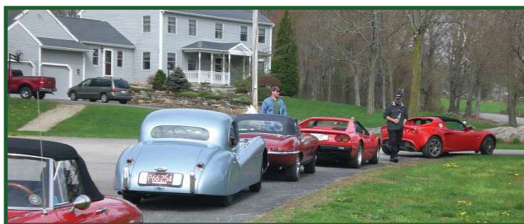
Cars at one of the checkpoints during our 2009 rallye