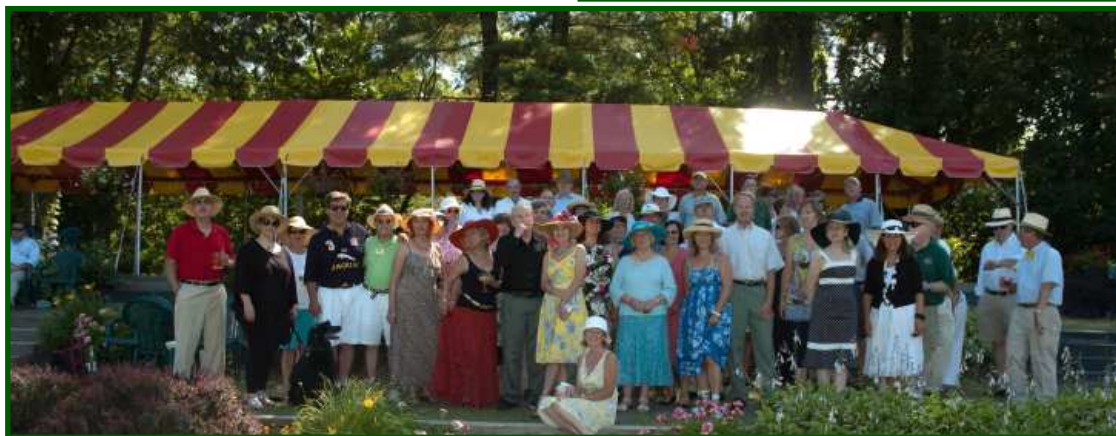
The obligatory group photo in front of the viewing stand