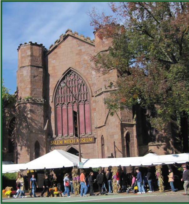
Our 2009 tour began at the Salem Witch Museum