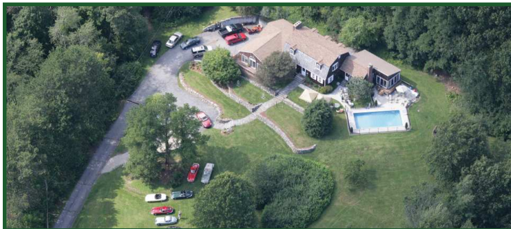
Scenes from last year's event -- aerial view of cars on the lawn, and a ground-level view of JANE folks sitting around talking cars.