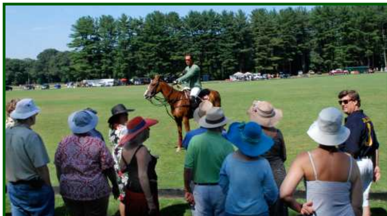
Before the match began, one of the polo players came over to explain the finer points of the game to us