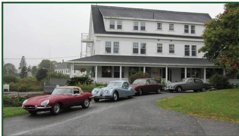
JANE Jaguars lined up in front of the Eastwind Inn when we were there last year

October is a popular time to visit Maine, so make your reservations at the Eastwind Inn soon. The number is 800-241-8439, and be sure and tell them you are with the JANE group. More information on the Eastwind Inn is at www.eastwindinn.com . 🇺🇸