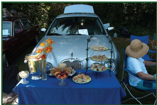
Left: How's this for a fancy picnic?