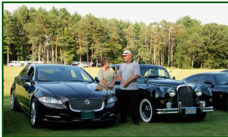
A new XJ shares the field with Tom Brady's 1961 Mark IX