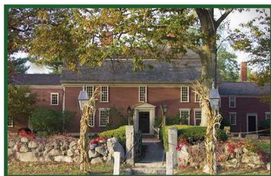
Longfellow's Wayside Inn

J ANE's monthly meetings are at 7 p.m. on the fourth Wednesday of each month (except for November and December - see calendar). Our August meeting will be at the beautiful, historic Longfellow's Wayside Inn in Sudbury on Wednesday, August 25th. Plan to come a little early to "kick the tires" and schmooze in the Old Bar before dinner and the meeting. It's the perfect way to keep up with what all your JANE friends are doing. Be there! 🇺🇸