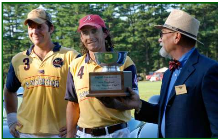
Here's a nice shot of the JANE Jaguar Cup that was presented to the winning team